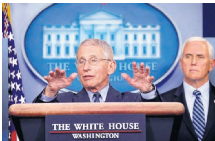
Dr. Anthony Fauci, director of the National Institute of Allergy and Infectious Diseases, speaks about the coronavirus in the James Brady Press Briefing Room of the White House, Wednesday, April 1, 2020, in Washington, as Vice President Mike Pence listens.

The $2.2 trillion rescue package that was signed into law last week includes $350 billion in small business loans that can be forgiven if the companies use the money to retain or rehire workers. This provision could help limit future layoffs or lead some companies to recall employees back to work. □